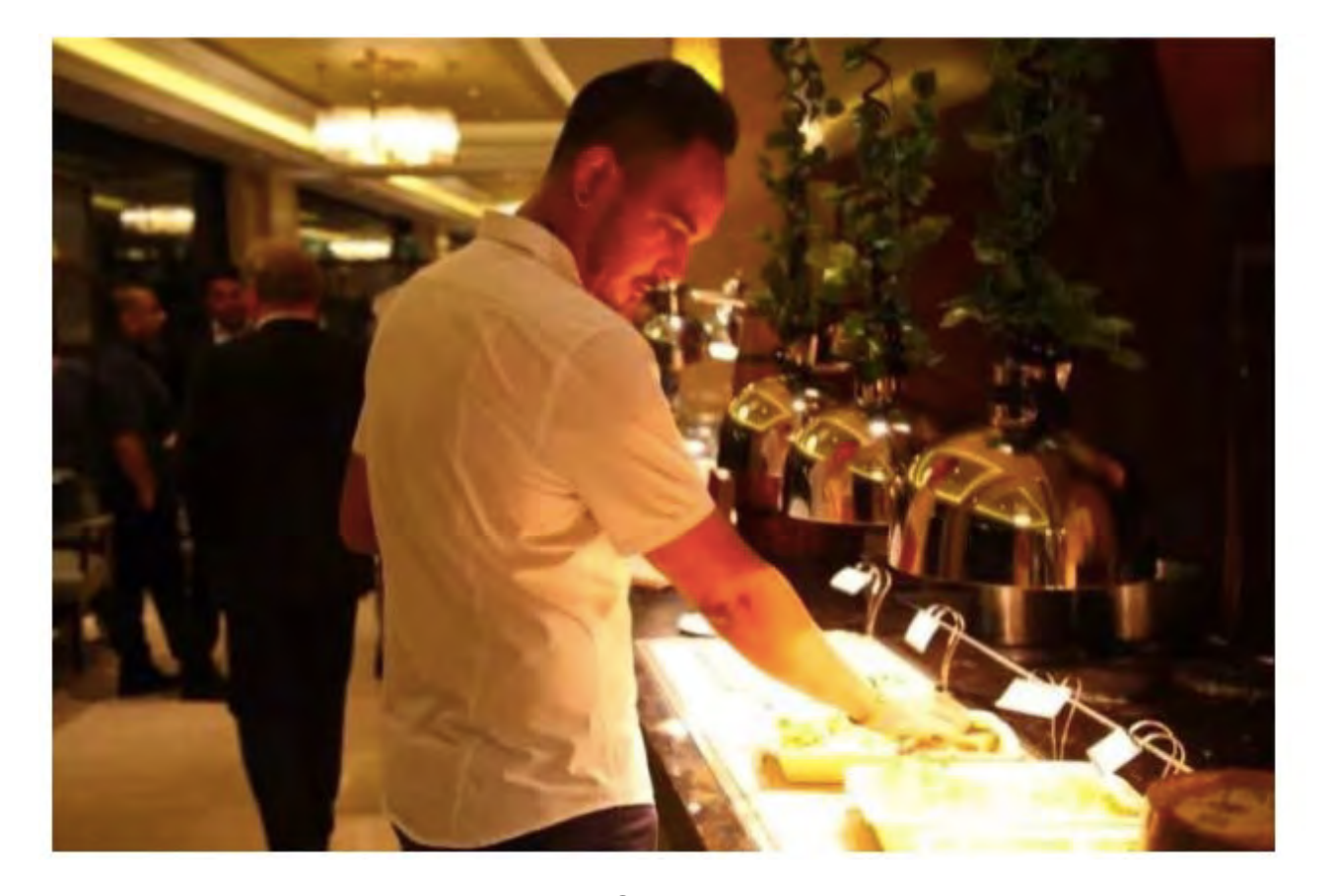
A total 35 top executives from Shanghai, Tokyo, Hangzhou and other cities joined this tech conference.